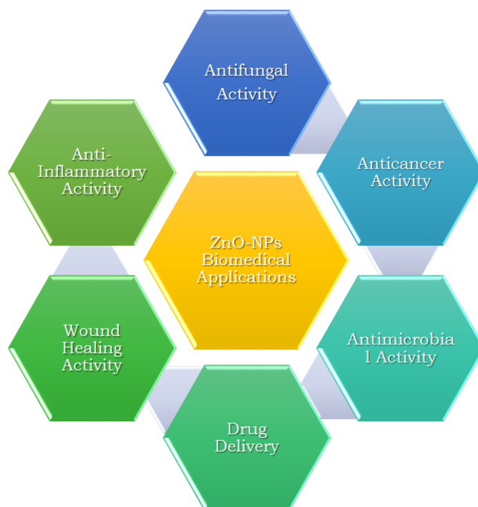
Figure 1. Potential biomedical applications of green synthesized ZnO-NPs.

A recent development in the emergence of nanotechnology and ZnO-NPs has led to significant enhancements in biomedical applications of nanomaterials. Use of natural raw materials and living organisms as capping and reducing agents for the synthesis of ZnO-NPs provided better biocompatibility and responses for their interactions with biological tissue which enhances their performance substantially. As a result, green synthesized ZnO-NPs are famous as effective and viable nanoparticles that can be used to target bacterial infections, devastate the membrane of cancerous cells or deliver various compounds to diseased tissue, and to measure concentrations of distinctive biomarkers inside the body. Since numerous literatures is available for different applications of ZnO-NPs in biology and medicine, Fig. 1 represents the diverse biomedical applications of ZnO-NPs that are elaborated below.