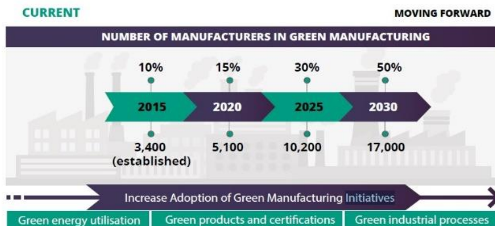
Fig. 1. Aspirational target for the manufacturing sector in Malaysia [3].