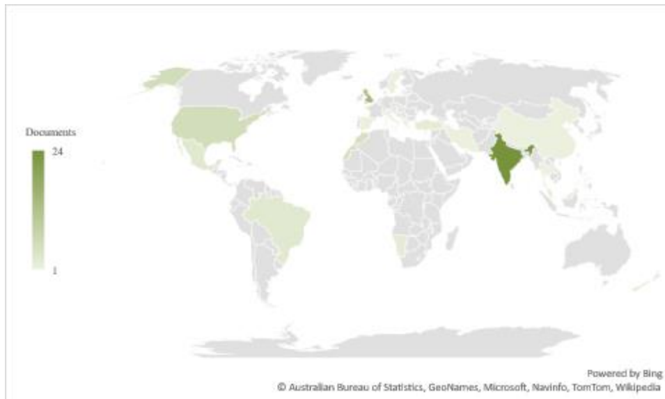
Fig. 4. Distribution of GLSS documents across the world.

Three prolific authors have more than five publications on the subject. The leading author is Garza-Reyes, J.A., who explained “Green lean and the need for Six Sigma [9]”, with a maximum number of seven publications followed by Rathi, R. (7 articles), and Kaswan, M.S. (6 articles). Fig. 4 shows the distribution of the authors’ affiliations from 20 countries. India, the UK, and the US as the three most dominant countries have the greatest number of affiliations, with 24, 15, and 6 documents, respectively.