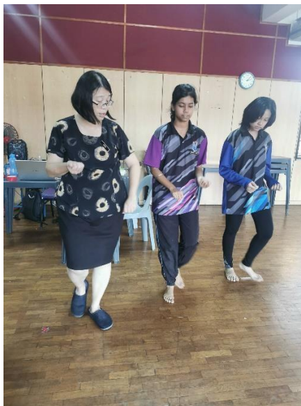
Photo 1. Teacher assists young learners