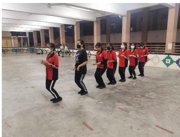
Photo 2. Training with music

In our approach to ensuring young learners master their skills, we used music, so that they can easily embrace themselves with the move according to the rhythm and tempo of the music played. In this regard, counting from 1 to 8 is pertinent as indicated in the following reflexive diary: