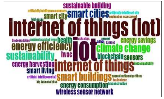
Fig. 1. Word cloud based on author keywords

A quick check on the shortlisted papers from Scopus and Web of Science databases help us to word cloud based on Author Keywords and Indexed Keywords. Author Keywords consist of a list of terms that authors believe best represent the content of their paper. They are often selected prudently. Author keywords in Figure 1 and Figure 2 may lead us to have an idea on what the authors have been focusing on during year of 2019-2023. To support the findings on the evolution of IoT applications in sustainable buildings, a statistical validation was performed. First, a Chi-Square test was conducted on the frequency distribution of keywords from 2019 to 2023 to determine whether there were significant shifts in research focus. The test resulted in a Chi-Square statistic of 7.02 with a p-value of 0.856, indicating that the variations in keyword usage over time are not statistically significant and the focus areas in IoT research have remained relatively stable.