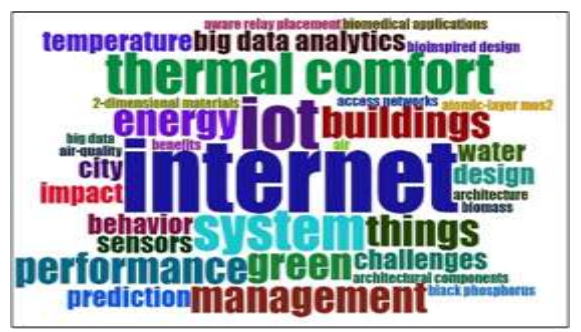
Fig. 2. Word cloud based on indexed keywords