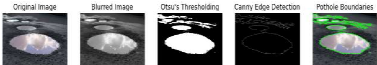
Fig. 9. Pothole example in wet road surface

affirming its robustness and utility in diverse and reflective environments like wet roads, which is critical for real-world applications in road maintenance and vehicle safety.