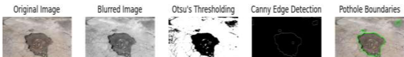
Fig. 8. Pothole example in clear daylight conditions

The illustrated case in Figure 8 exemplifies the algorithm's proficiency in navigating through the complexities of image segmentation and boundary detection. The step-by-step portrayal underscores the transformation from a raw road image to a precise delineation of a pothole, encapsulating the essence of the algorithm's intended functionality. This example vividly demonstrates the algorithm's capacity to accurately detect potholes, providing invaluable insights for road maintenance and safety enhancements.