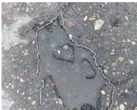
Fig. 6. Extract contours

A contour is a continuous curve or boundary that represents the outline of an object or a region with the same intensity or colour in an image. In the proposed method contour analysis can be used to identify and analyse the boundaries of potential potholes after initial edge detection. By extracting relevant properties from the contours, such as the area or shape, one can distinguish potholes from other image features. Contours can be represented as a series of points or as a hierarchy, providing information about the relationships between different contours. Each point in the contour represents a coordinate on the boundary. Contour analysis is crucial for extracting meaningful information about objects within an image. There are two stages for contour analysis in the proposed methods Extract Contours as shown in Figure 6 and segmentation masks as shown in Figure 7. The Importance of extracting contours is to identify the actual potholes because sometimes shadows, cracks or debris are extracted by CCA as connected components. Once the true potholes are identified using contour analysis segmentation masks precisely separate the potholes from the background (pothole outlines) and this allows us to accurately identify the region of potholes.