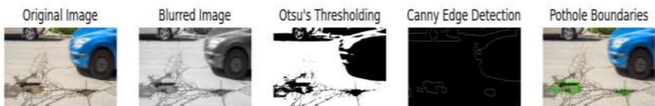
Fig. 10. Example pothole 3 for challenging environment

As illustrated in Figure 10 the results underscore the Pothole Boundary Detection Algorithm's capability to accurately identify and outline potholes in difficult environment conditions, which contributing significantly to the advancement of automated road maintenance and safety measures. The algorithm's robust performance across different environmental conditions demonstrates its applicability in real-world scenarios, marking a step forward in addressing the critical need for efficient and reliable pothole detection systems.