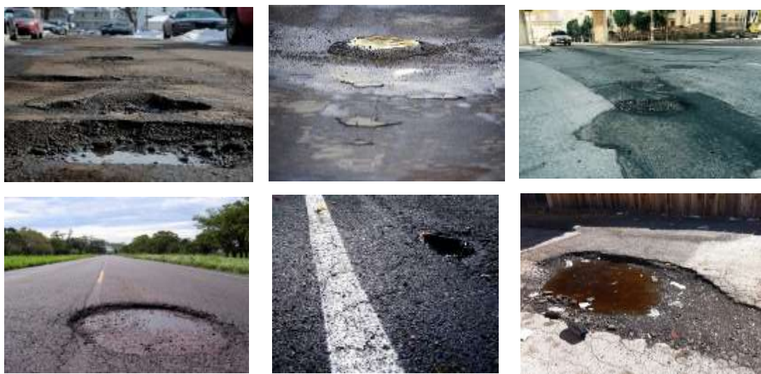
Fig. 1. Different scenarios for pothole conditions

As the initial step, gather road images with potholes in various conditions the images will be separated to apply and test the algorithm on the images. The Figure 1 shows some examples of road potholes that need to be detected by the proposed method to determine the region and identify the boundary and area for each.