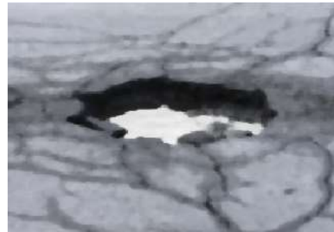
Fig. 5. Median filtering