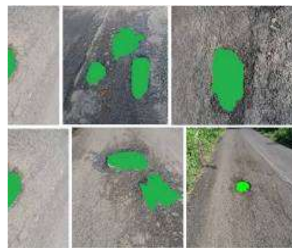
Fig. 7. Segmentation masks for pothole detection