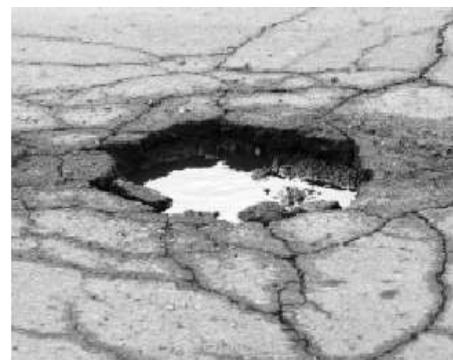
Fig. 3. Pothole greyscale