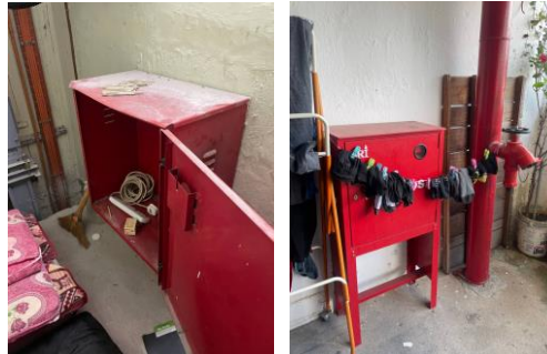
Fig. 5. Wet riser and hose reel

tenants that obstruct entry. This shows a serious lack of fire safety management, which can endanger the occupants. Therefore, immediate action needs to be taken to ensure that all wet riser and hose reel systems are installed correctly, work properly and are regularly maintained by established regulations.