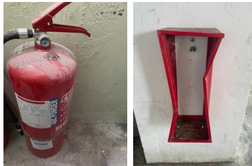
Fig. 3. Fire extinguisher problems

The fire extinguishers in Buildings A, B and C (Figure 3) are in poor condition and do not comply with the legislation, as shown in the diagram below. It was discovered that several fire extinguishers were missing, some were not functioning correctly and the expiration date had gone past the maximum. Tenants have also vandalized fire extinguishers and some of them have been buried under other items or left on the floor, making it harder to get to them in an emergency. According to UBBL 1984, Part VIII, Clause 225, every building must have a fire extinguisher that complies with the tenth schedule. This schedule states that residential buildings less than 120 meters high or between six and forty stories must have fire extinguishers that work properly and are in good condition. Lack of regular maintenance and inspection shows an attitude of indifference that can endanger the lives of building occupants.