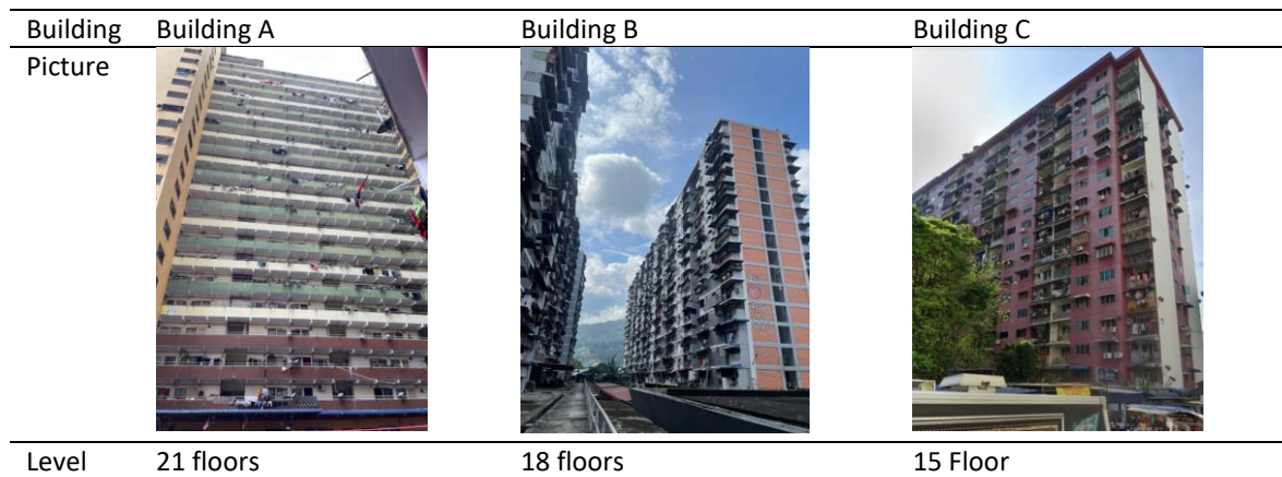
Fig. 2. Three types of building for the case study