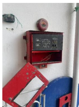
Fig. 4. Fire alarm and monitoring system

Based on the analysis of the alarm system and fire monitoring in Buildings A, B and C (Figure 4), the three buildings do not meet the requirements as stated in the Tenth Schedule of the UBBL 1984 which stipulates that every residential building of six to forty floors or less than 120 meters in height must install and ensure the fire alarm system and monitors are in good condition. In Building A, the fire alarm and monitor system did not work due to the lack of monitoring and inspection by the building management. Buildings B and C do not have alarm systems and fire monitors due to lack of funds and high installation costs. Therefore, the building management needs to conduct periodic monitoring and inspection and provide a fire alarm system and monitors that work well to ensure the safety of building occupants.