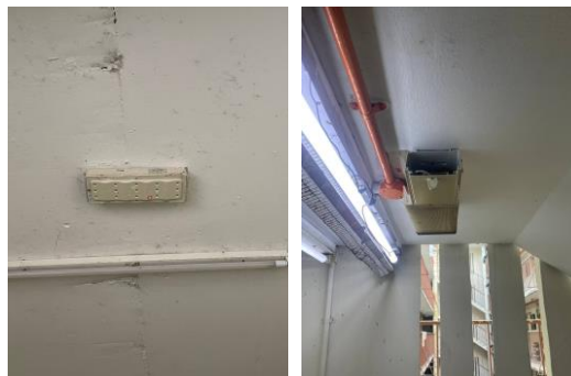
Fig. 6. Emergency lighting system problem

Buildings A, B and C's emergency lighting systems (Figure 6) were discovered to be malfunctioning during an inspection, and numerous emergency lights were either missing, broken or not lighted. The emergency lighting system has been seriously damaged as a result of this condition, which suggests a lack of routine inspection and maintenance. A functional emergency lighting system was required for residential structures with six to forty stories or less than thirty metres in height, as per UBBL 1984, Part VIII, Clause 253, Tenth Schedule. In addition to breaking the law, Buildings A, B and C's disregard for these rules puts the residents' safety risk. Therefore, building management needs to immediately repair and replace damaged emergency lights, ensure that all emergency lights are working, and carry out regular inspections and maintenance to ensure the safety of all building occupants.