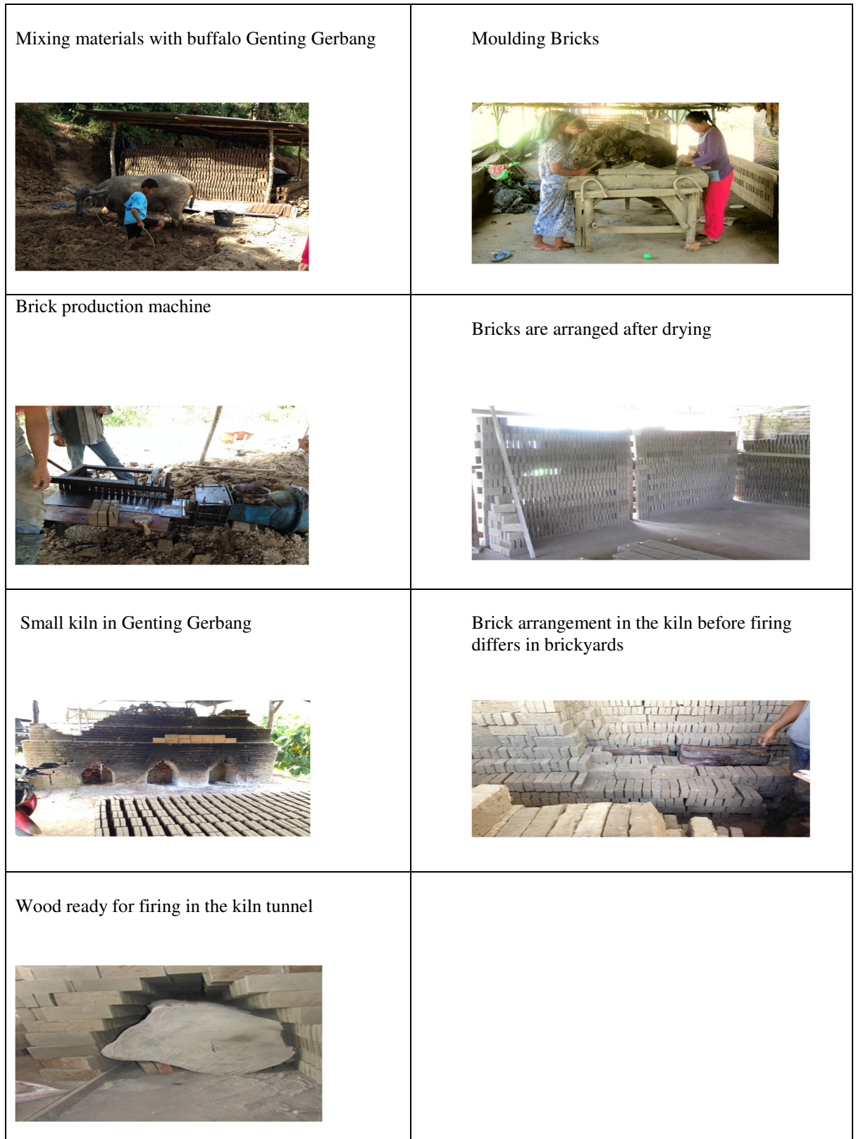
Figure 2: The process of making brick