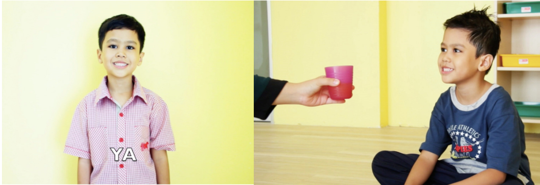
Figure 3: Gesture Module

According to Figure 2, Emotions module displays different children expressing three different emotions, which are happy, sad and anger. In the module, the children acted out different conditions on why those emotions could happen. This would give a clear view to the children on how and when those emotions should be used and occur. Most children with autism does not understand emotions and have trouble showing emotions as well [22]. Hence it is fundamental for children to learn those emotions and apply them accordingly.