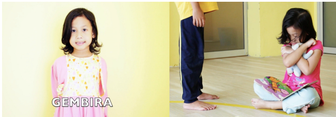
Figure 2: Emotion Module

Based on Fig. 1, Introducing Yourself module displays a two-way interaction between an adult and a child. A series of simple basic questions were being asked to the children regarding on themselves. Example; ‘What is your name?’, ‘How old are you?’ and ‘Where do you live?’. Since these children are having problem even in basic conversation, therefore it is crucial to ask simple understandable questions for them to answer.