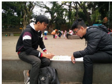
Fig. 7. Discussion and Interview

Based on data collection from interview session to 8 respondents, social acceptance benchmark can be acquired. Analysis was conducted by discussion and giving interview guidance to respondents.