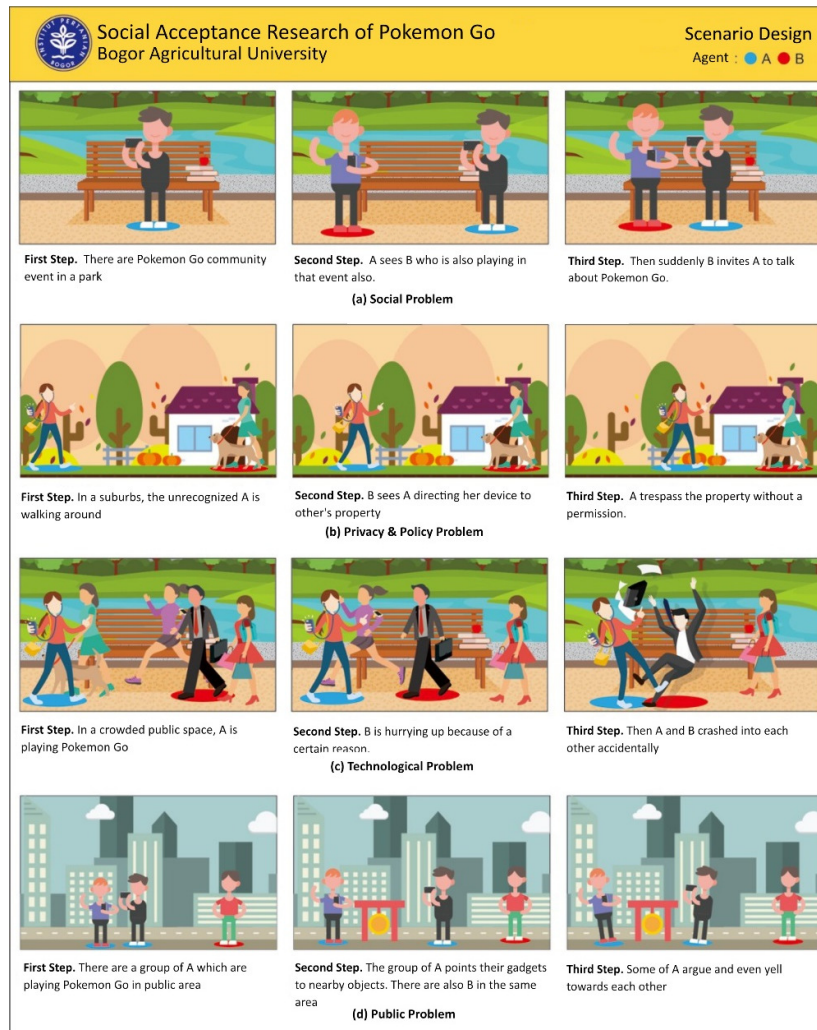
Fig. 5. Scenario results based on social problems

user perspective is a person who plays Pokémon Go whose character reached level 10 or above. This research was conducted in Taman Sempur area, Bogor. Taman Sempur was chosen as the research area because there are a big Pokémon Go community in this area so that the experience of the social problems can be perceived and researched directly. Data collection in the interview session were conducted with discussion and audio recording to 8 randomly picked respondents. Table 5 shows the respondents characteristic results based on gender and age.