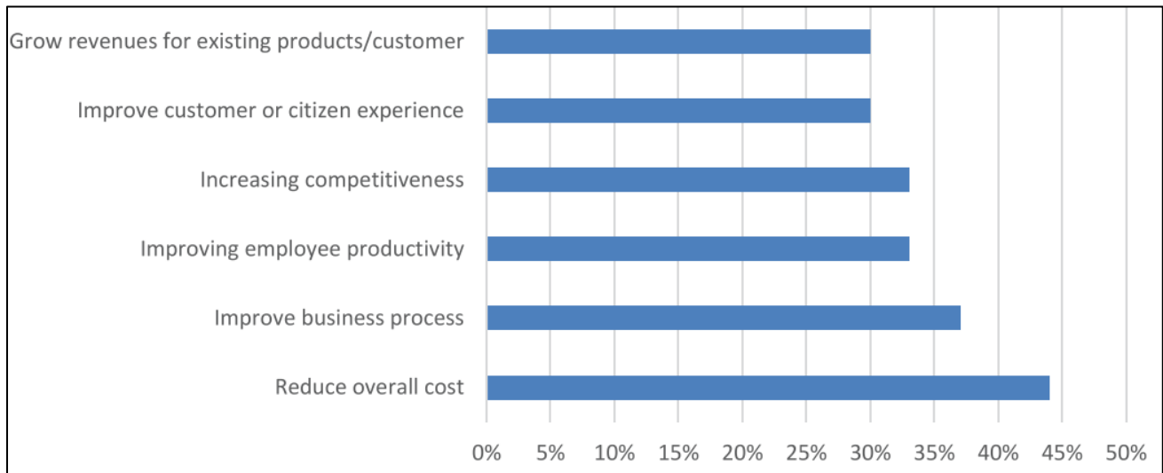
Fig. 1. Drivers for IoT adoption by manufacturers.

Another study by Sam et al. [25] reported that the driving factors for manufacturers adopting IoT is attributed to competitive, efficiency and productivity gains rather than improving the safety of the infrastructure and employees (Figure 1). Therefore, there remain a vast opportunity to enrich the literature on IoT or IIoT adoption in the context of improving safety performance in manufacturing industries.