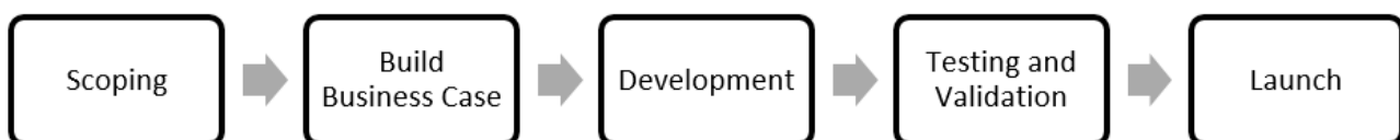
Fig. 1. Proposed modification on New Product Development Process [8]

Another literature, proposed a five-stage process gate in a new product development process. This is an improvement of the six-stage gate he highlighted earlier [8]. The author suggested that firms should not remain in the same industry boundary in order to stay competitive. Based on this, an improved model was proposed. The improvement was made based on her investigation of previous new product failure cases. The six-stage process includes idea discovery, scoping, building business case, development, testing and validation, and finally launch. His single modification on the new product development process is as shown in Figure 1: