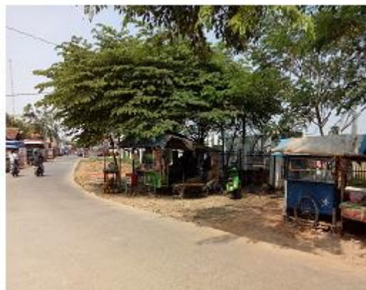
Fig. 4. Small Traders

Based on the information from the caretaker (juru kunci) of TKP, the traders are indigenous people who live around TKP and do not have permanent jobs. Usually, holidays or at certain times, there will be a small crowd of traders around the area. There is no community that abbles in other businesses other than trading and there were only janitors who were paid by the local government for jobs like sweeping the streets, cutting grass, and repainting the colours of the wall or rebuilding fences around TB and TKP.