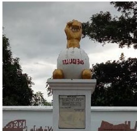
Fig. 3. Tugu Kebulatan Proklamasi (TKP)

Initial observations in February and March 2018 conducted for this research showed that the number of small traders grew surrounding TKP. For instance, they occupied half on the side of Tugu Bojong (TB) precisely, signifying that many people can use the opportunities to dabble in small businesses. The condition was very different when researchers conducted a similar research at the same place in mid-2017.