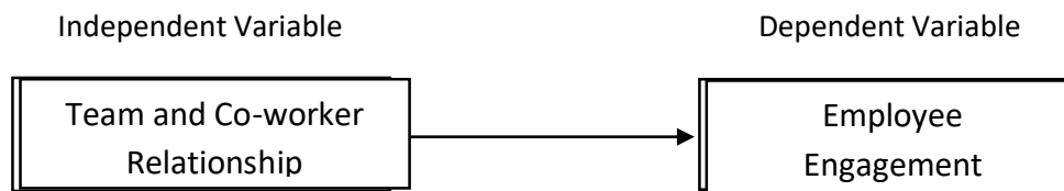
Fig. 1. Framework

Team and co-worker relationship affect the withdrawal or resignation of the employee from the place of work. This is attributed to the rules and formal policies that lead to lack of communication in the Federal University of Technology Withdrawal or resignation can arise because of structural situations. When the relationship among co-workers is high, the workers benefit from the relationship [7]. Similarly Sharing goals and knowledge probably makes workplace more satisfying and therefore, more enjoyable. These types of interactions keep employees engaged by facilitating communication and networking opportunities [8]. Hence the need for this study, aimed at assessing the correlation between team and co-worker relationship and employee engagement.