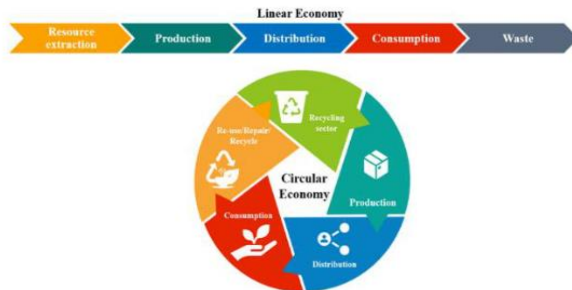
Fig. 2(b). Linear Economy versus Circular Economy. Adapted from Circular Economy and Linear Economy Presentation Graphic [44]