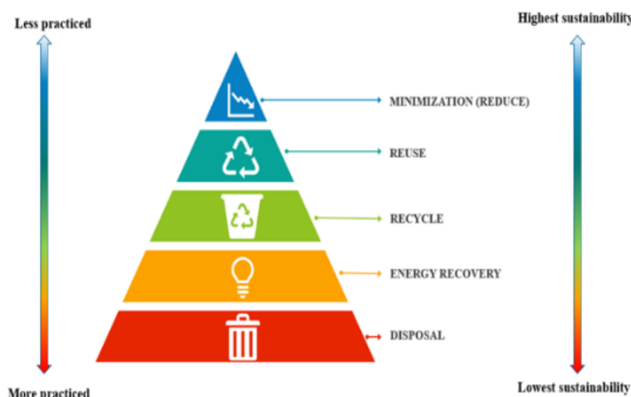
Fig. 2(a). Waste management Hierarchy Adapted from Cristóvão [39]